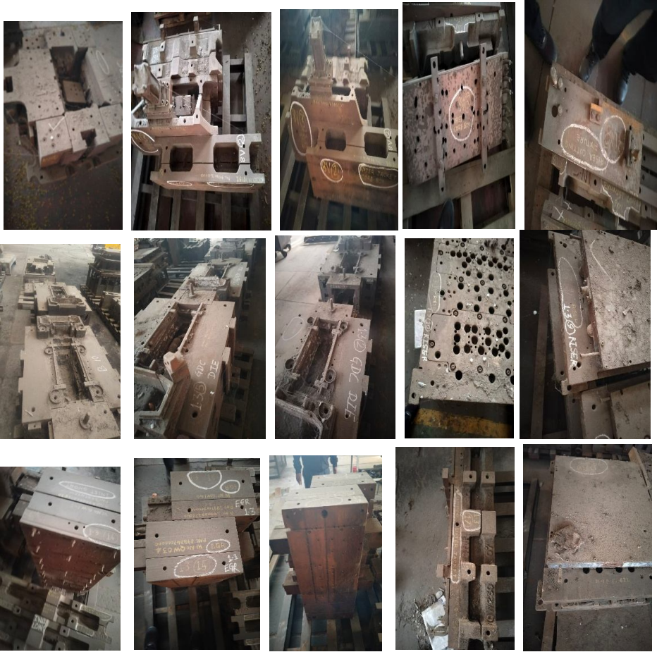
BELOW PHOTOS ARE FOR ONLY FOR REFERENCE